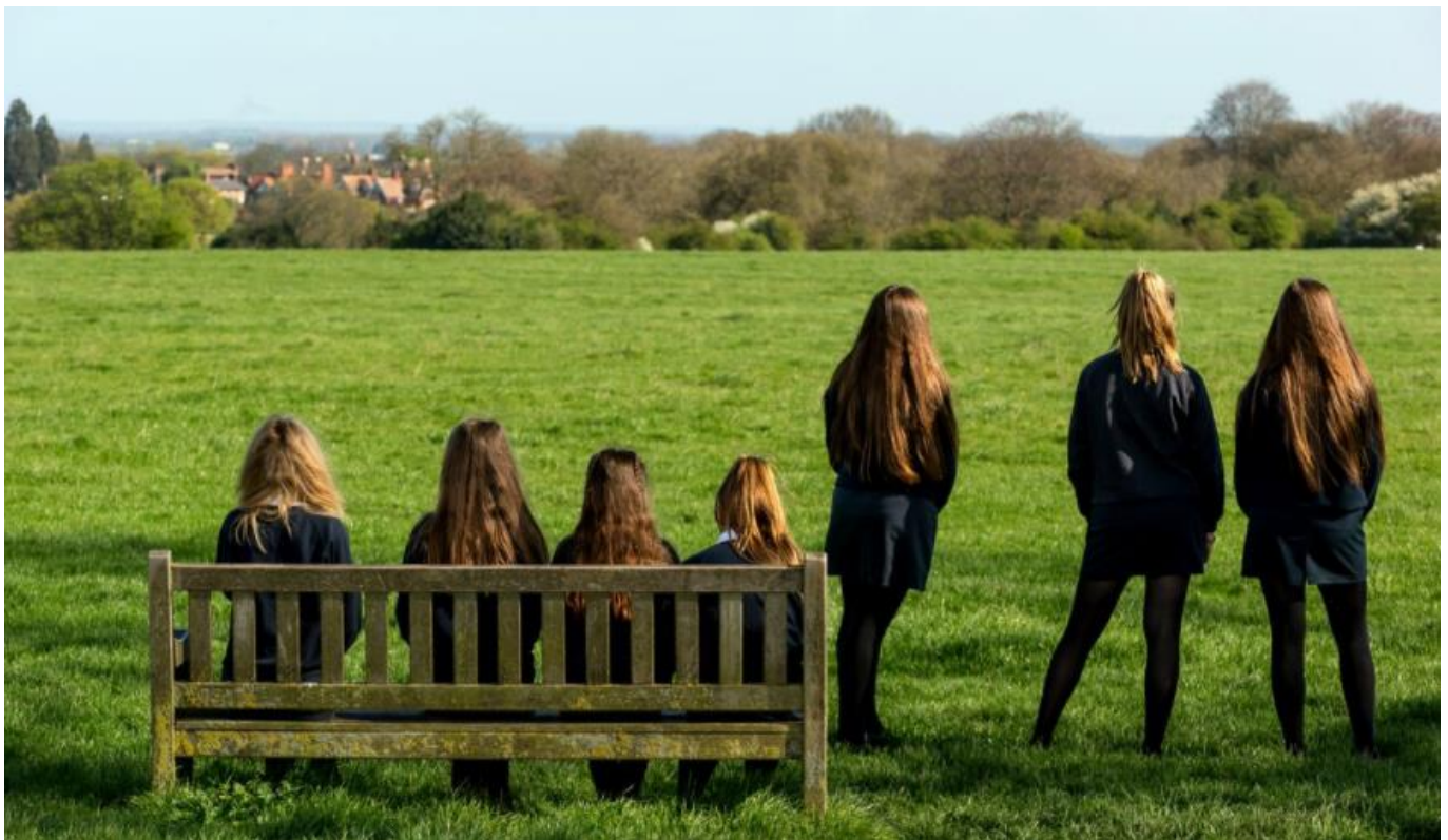
The Westwood, Beverley

Beverley High School is pleasantly situated in the centre of the attractive market town of Beverley in the East Riding of Yorkshire. The catchment area is socially mixed and provides a full range of ability, taking students from Beverley and the surrounding villages of Tickton, Walkington, Wawne and Woodmansey.