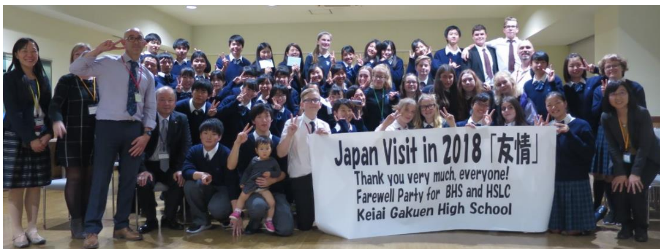
Japan Visit 2018

Beverley High School holds the YHGSA's Global Schools Award which recognises the international dimension in the school. All departments in the school are encouraged to incorporate international/global elements into their Schemes of Work. Opportunity for curriculum development exists, most notably with our link schools and colleges, Keiai Gakuen Senior High School in Chiba, Japan; Sujatha Vidyalaya College, Matara, Sri Lanka; Marcel Aymard College, Millau, France; and most recently Gymnasium Am Kothen, Wuppertal, Germany. Student and teacher visits to Japan and Sri Lanka are a part of school life and we are really hoping that we will continue to visit our links overseas as soon as regulations allow.