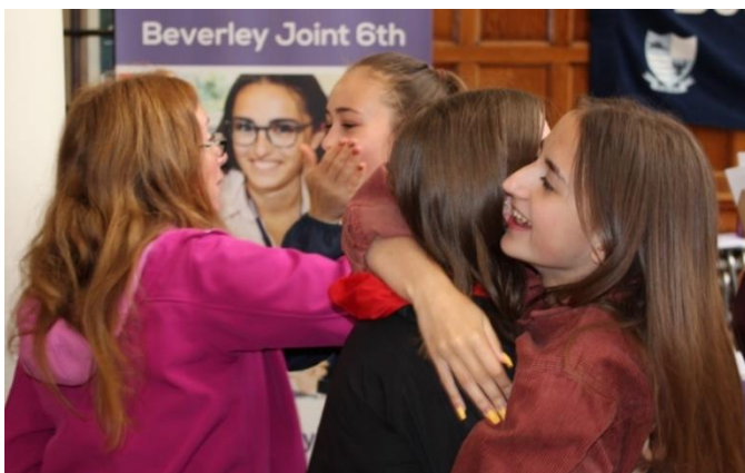
Results Day 2019