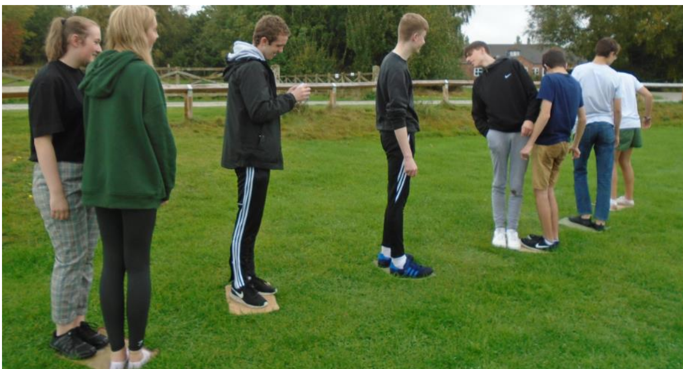
Joint Sixth Form Trip to Allertorpe Lake

In September 1978 the Sixth Form was linked with our neighbouring boys' comprehensive, Beverley Grammar School. The teaching in most advanced level subjects is equally shared between the staffs of both schools. The scheme carries the advantages of widening the range of courses, provides larger numbers in teaching groups and a livelier academic life. Both schools have a lengthy and successful experience of sixth form work and students have benefited from this pooling of resources. Many students continue to Higher Education, including Oxbridge.