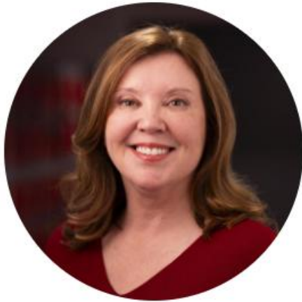
Dame Rachel de Souza Children's Commissioner for England