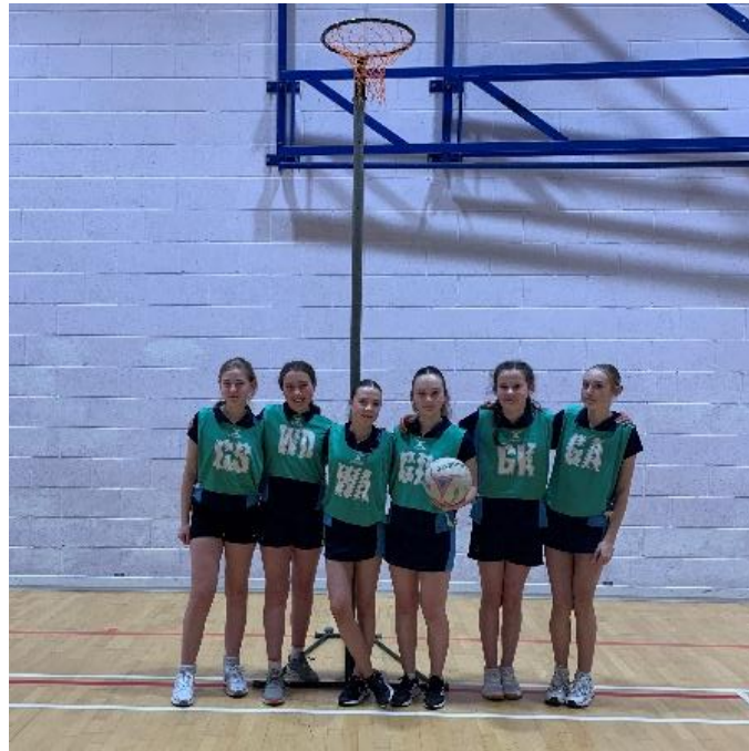
Year 8 Team