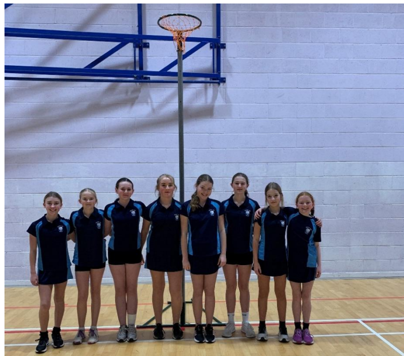
Year 7 Team

On 28 January our Year 7 & 8 teams enjoyed some very competitive games against South Hunsley School. We lost both games to very strong Hunsley teams, but the students progressed as the match went on and displayed some excellent movement and passing skills throughout the court.