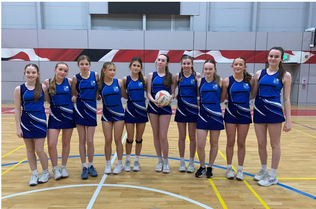
U14 Netball Team