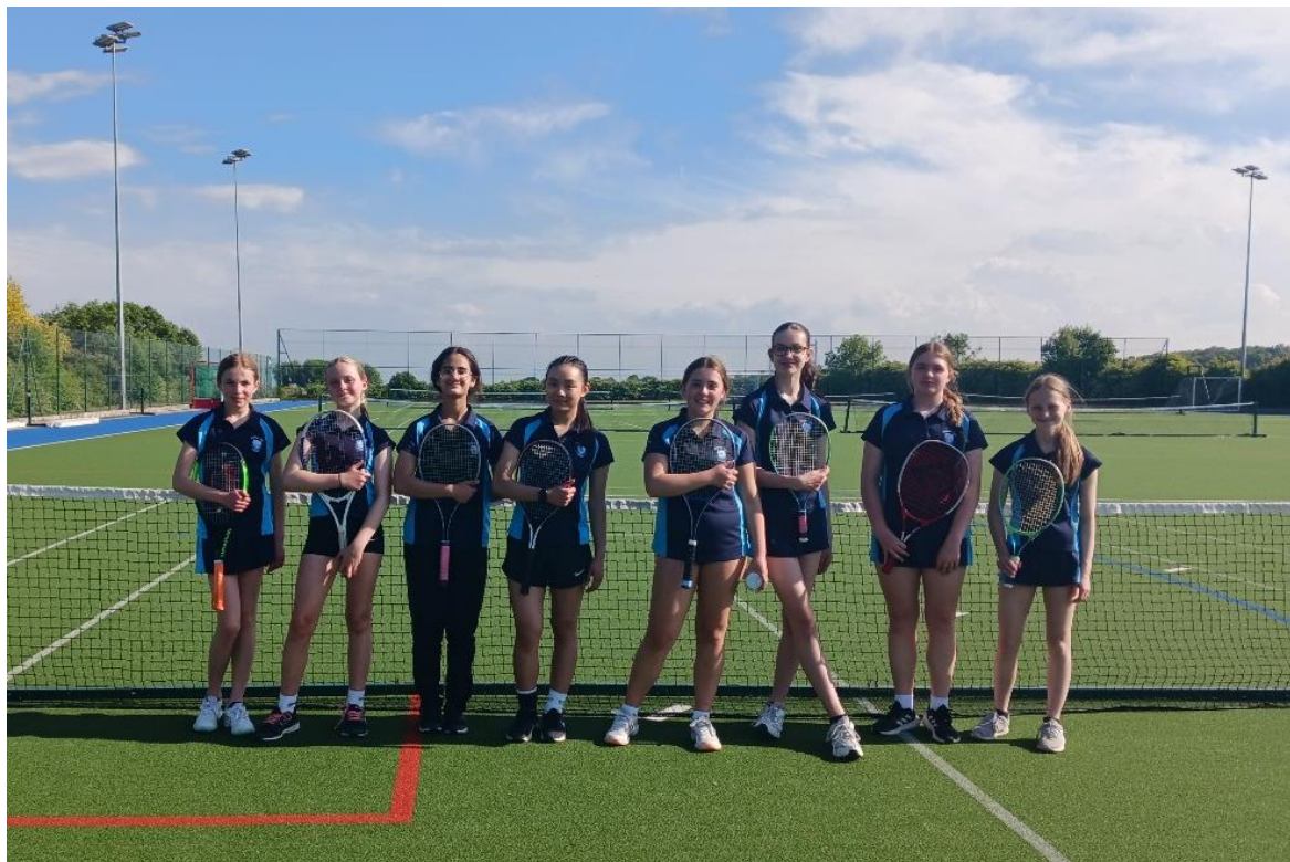
Year 9 & 10 Students at Tranby

Our Year 7 students also played at Wolfreton School on Monday 19 th May. We took eight students altogether who competed in some enjoyable games of doubles. All students from both schools really progressed as the games went on and showed fair play and respect for others.