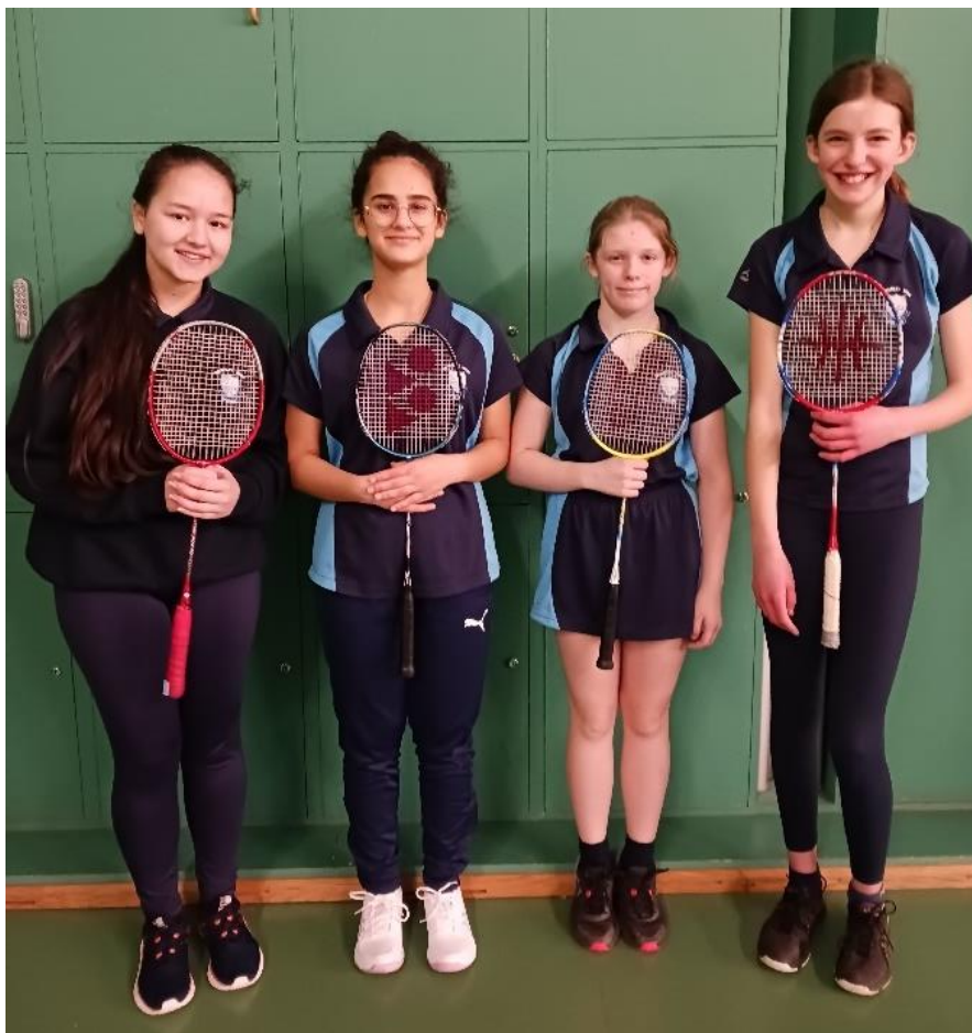
KS3 Badminton Team