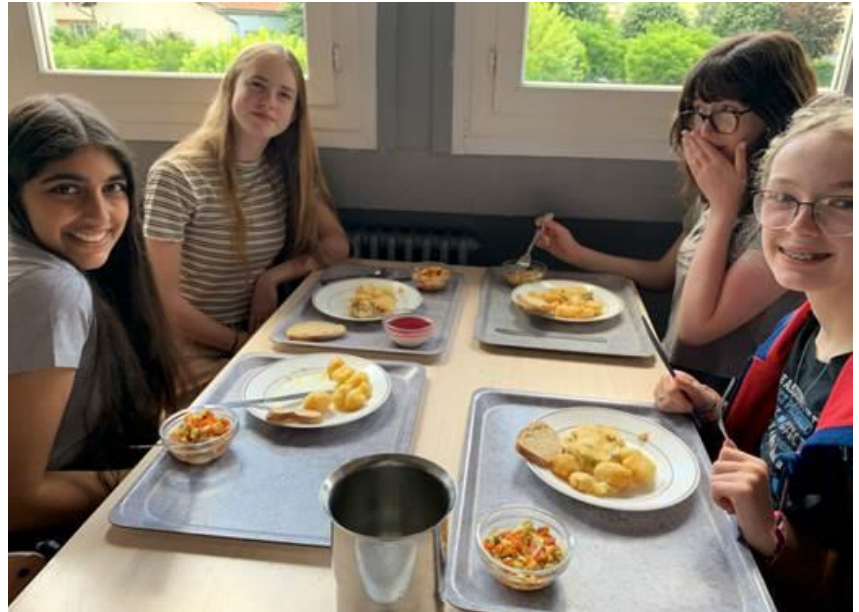
Sampling the food in the canteen