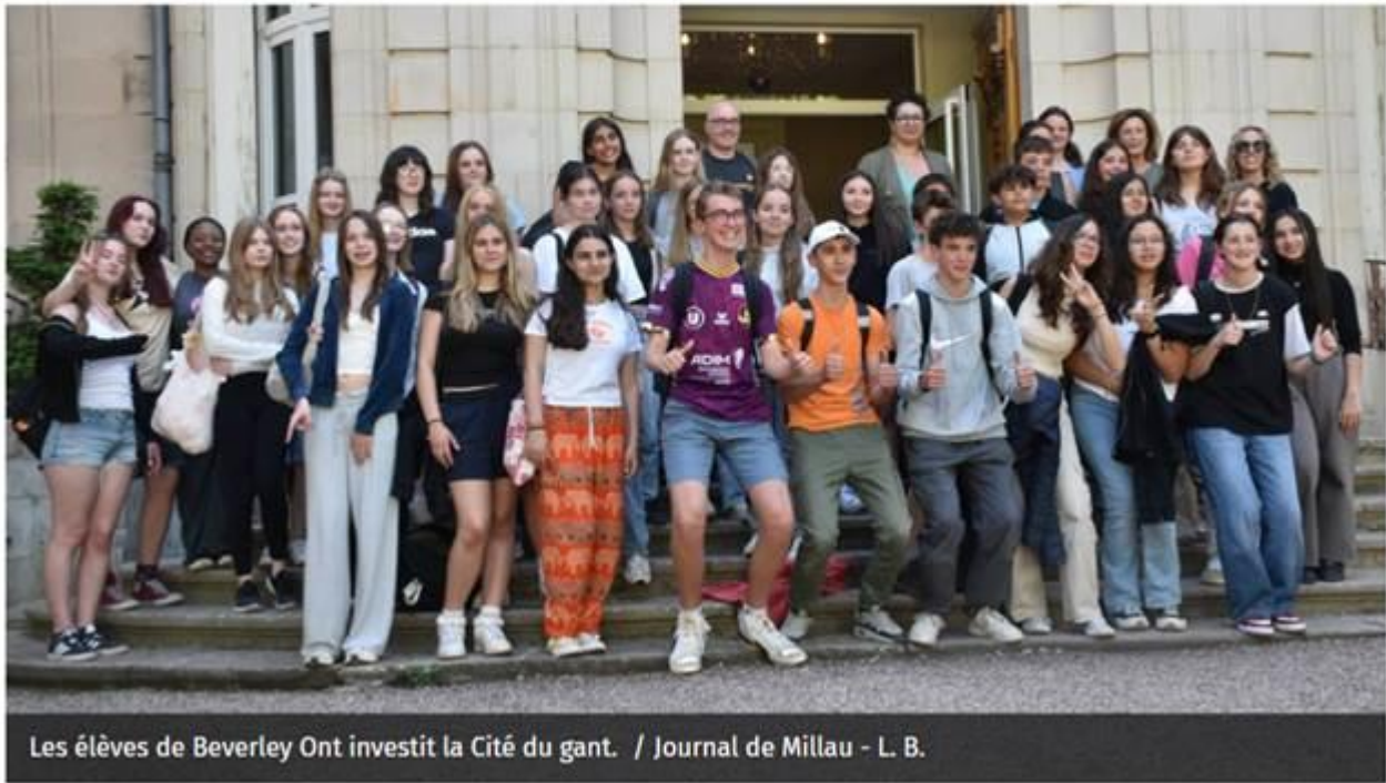
Les élèves de Beverley Ont investit la Cité du gant.

The local newspaper reports on our visit