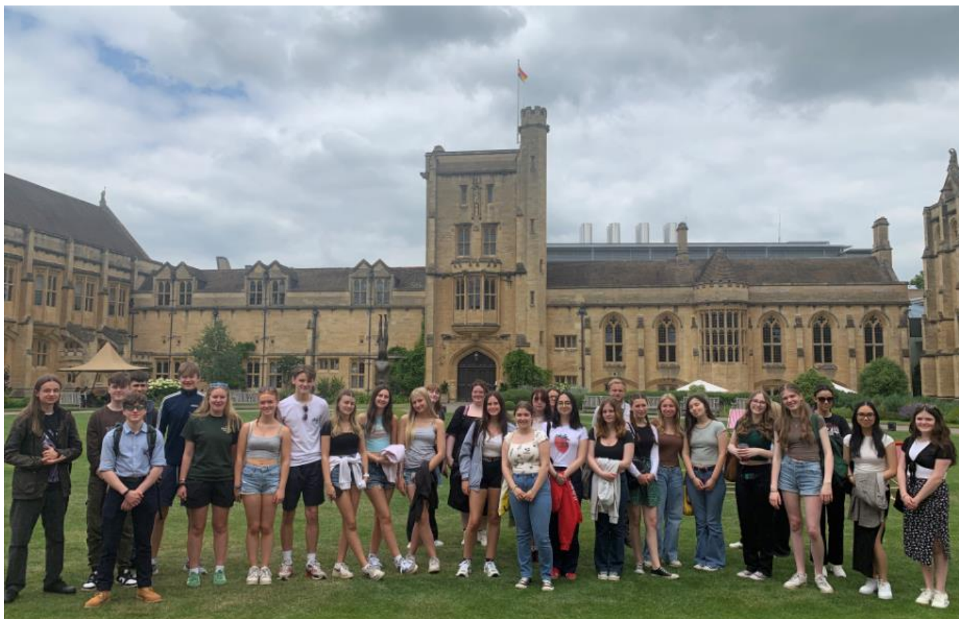
The group at Mansfield College

27 Year 11 students from Beverley High and Grammar Schools travelled to Oxford on Monday 24 th June to spend the day discovering what it is like to study at Oxford University. They took part in a college tour, heard a presentation about how to make the most of A level study and also experienced a tutorial-style session at the Pitt Rivers Museum.