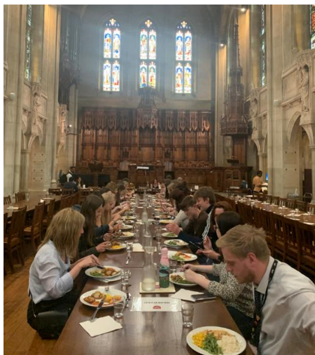
Lunch in Hall