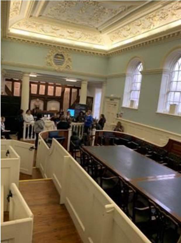
Visiting the Guildhall

Twenty French students accompanied by three of their teachers spent a week visiting Beverley High School and staying with host families. The students are from our partner school Collège Marcel Aymard in the southern French town of Millau. The students have had a packed schedule and have had the chance to shadow lessons in school; visit the Guildhall in Beverley; spend time in York and Hull; go bowling with their partners; as well as taste fish and chips! Their visit ends with an early departure to Manchester airport but a final farewell afternoon tea with a visit from the Mayor of Beverley is planned to wish them a safe journey home. The host students are looking forward to making a return visit to Millau in June.