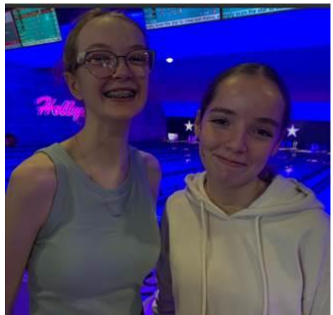
Exchange partners bowling together