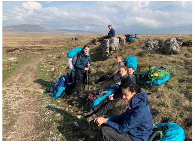
High spirits after reaching the top of Ingleborough with views of Pen-y-Ghent in the background