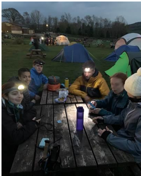
Relaxing at the campsite