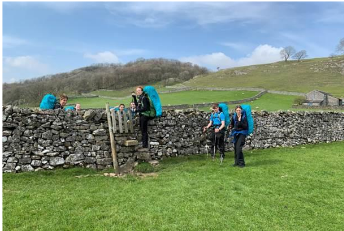
Windy conditions on Day 1

Our Gold Duke of Edinburgh candidates faced challenging conditions during their Gold Practice expedition from 21 st -23 rd April. Their 3 day route took them from Long Preston to Clapham and over Ingleborough before finishing in Settle. The second morning saw them packing up in torrential rain and tackling the ascent of Ingleborough in poor visibility, but they all rose to the challenge and supported each other and they were rewarded with a clear sky and fantastic views at the summit! It is fantastic to see how much the group are learning as they prepare for their final expedition in the summer in the Lake District. Well done to them all.