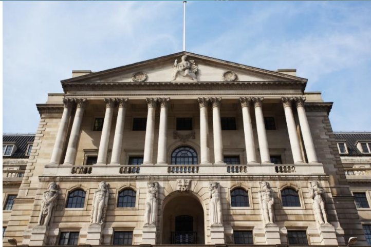
Bank of England