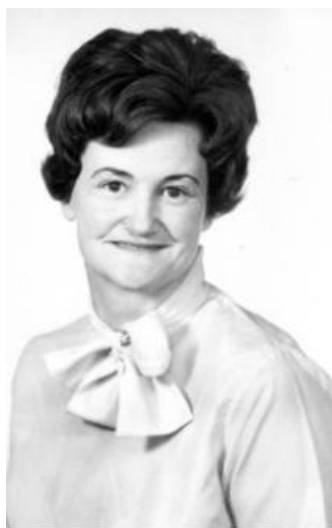
Margaret Powell in 1965